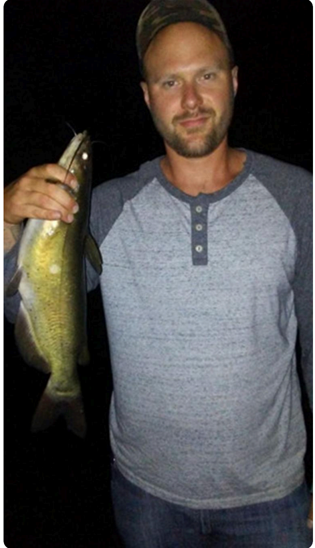
New Photo 1