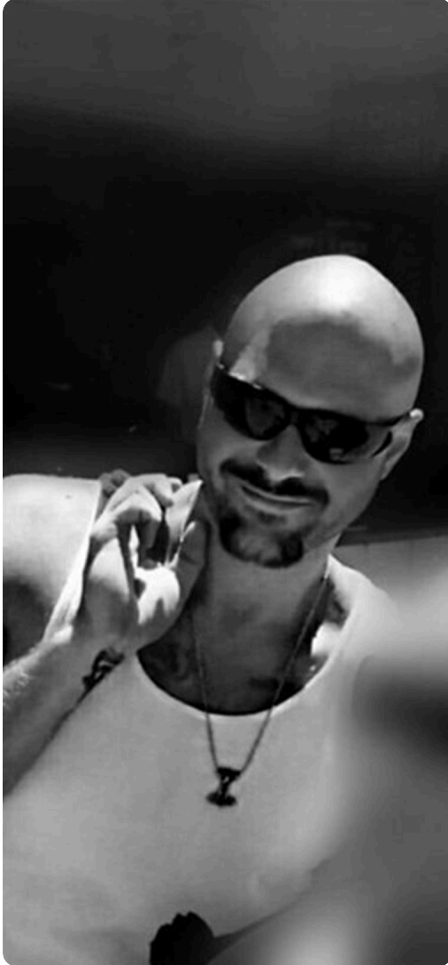
New Photo 1

Shoreline Memorial Services shared 2 photos to the New Album album. December 19 at 6:36 AM